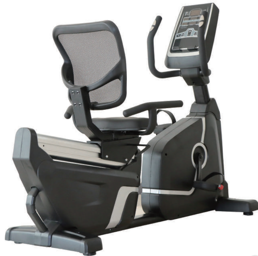
SD - 9500

Main material : steel Power: magnetic control unpower system Resistance: Reluctance type Gear: 32 stalls Electronic display: speed, time, calories etc Seat Adjust system: Aluminium, up/down, fore/back Flywheel: high power magnet Size: 1110*560*1480mm NW/GW: 65kg/85KG