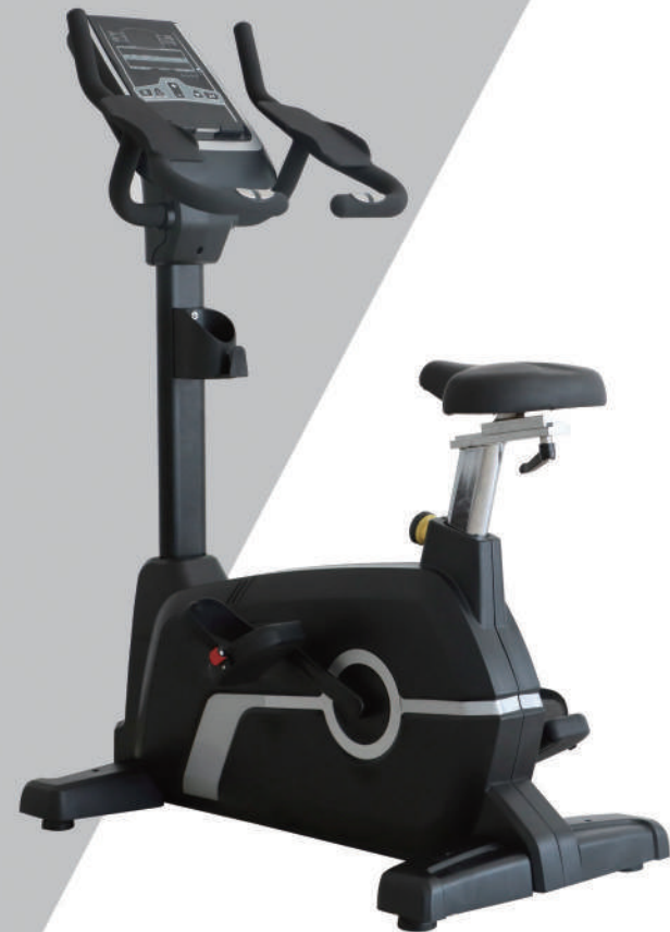
SD - 9700