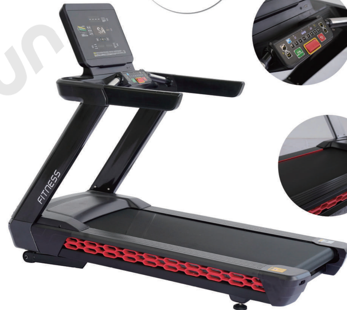
SD - 820

Shock Absorption system: T80MM shock absorption Motor incline: 0-20% Speed Range: 1-20KM/H Heart rate: hand held Console: 21.5" LED Button Screen Program: 12 groups of speed preset programs Motor: 3.0 HP PWM PV: 6.0 HP AC Machine Size: 2000*876*1630mm Running Area: 1550mm x 580mm Packing size: plywood case 2050*940*450mm Carton 900*550*230mm Max User Weight: 180KGS NW/GW: 160kgs/200g Wireless Charging: OPTION LED Running Light: OPTION